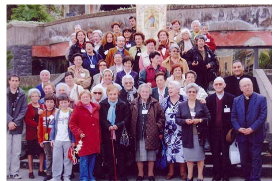
Partecipazione del pellegrinaggio Regionale dell'ADMA della Sicilia